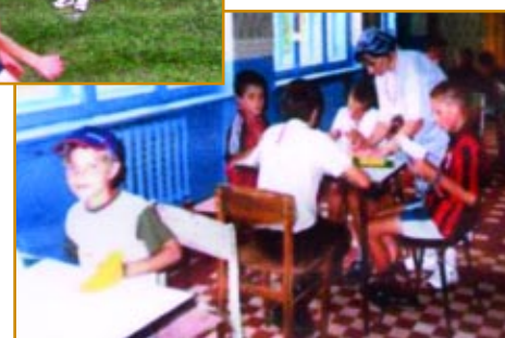
Craft time is a camp favorite